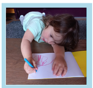
Hope was very happy to receive her CoTEDS art set!